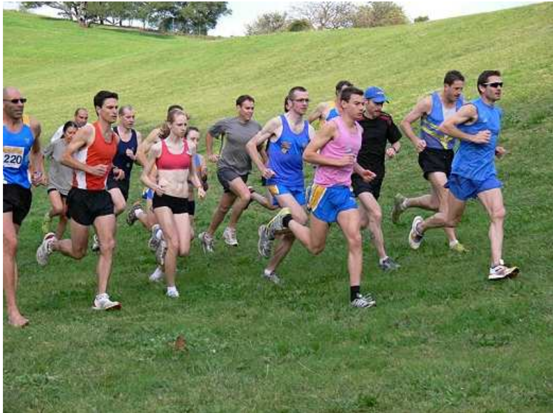
Botany Bolt 2009