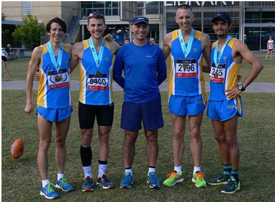
Open Men team after winning 10 th consecutive State title