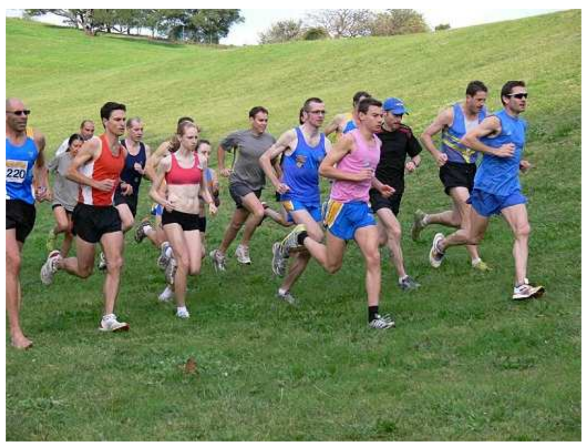
Botany Bolt 2009